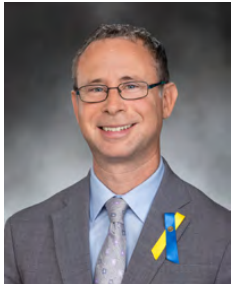
Senator Jesse Salomon (D)