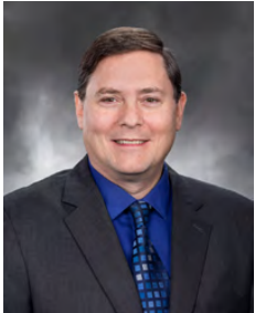
Senator Derek Stanford (D)