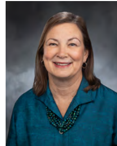
Senator June Robinson (D)