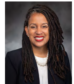
Rep. April Berg (D)