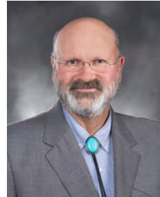
Senator Ron Muzzall (R)