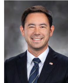
Rep. Clyde Shavers (D)