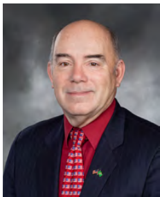
Senator Keith Wagoner (R)